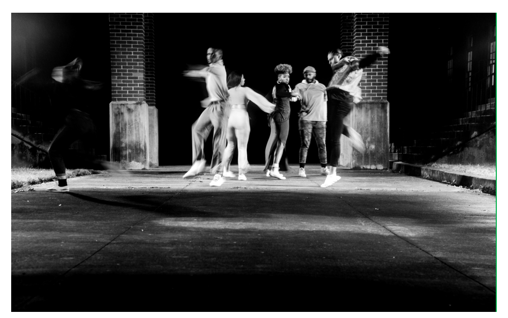
"PERMANENT: A Couple in Prospect Park (being together" 2022 Runtime: 28 mins

PERMANENT's second iteration references Dawoud Bey's "A Couple in Prospect Park,, Brooklyn, NY" 1990 from the permanent collection of Atlanta's High Museum of Art.